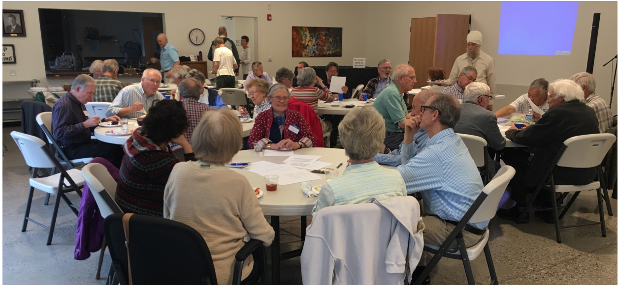
Audience at a typical Wednesday night dinner and presentation

from the large group, and then we broke up into small group discussions, each with about 6 to 8 people around a table, moderated by facilitators. The event formally ended at 8 PM, although participants often extended their discussions beyond that time. The average attendance at the Wednesday night sessions was 44, with a high of 52 and a low of 38. In a change from preceding summers, all Wednesday night meetings took place at Los Alamos Unitarian Church, 1738 N Sage Loop. Weekly announcements advertising the Wednesday sessions were placed in local news media, and a publicity postcard was produced (see Appendix IV) for distribution in the community.